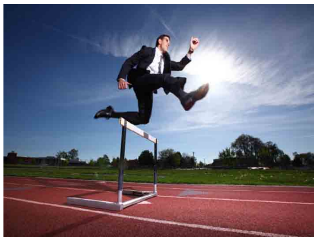
Find People Who Endure Who Regularly Do So

The key to using narrowcasting successfully is rather simple. Just identify the main attribute of the type of successful people you need to fill your position. Once you have accomplished that, then identify the type of people who would have that ability in a highly developed form in other professions or activities. This would mean, for instance, if you were looking for someone who had lasting endurance and could stay the course come thick or thin, then you might look to recruit people who had just finished the Iron-Man/Iron-Woman triathlon.