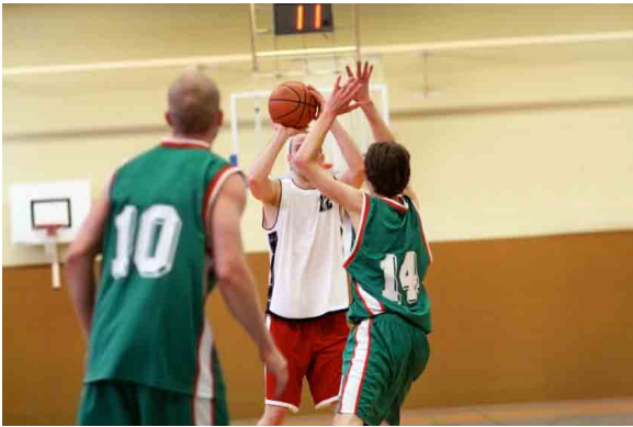
Teammates Work Well with Others and Enable Others to Succeed