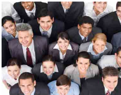
You Never Know Where Your Next Best Talent Will Come From

You will get the best results from narrowcasting if you emphasize active networking at social and public events, and also at activity clubs. Focus your sourcing activities on people groups who exhibit the attributes of those who are proven to be successful within your own company at specific jobs.