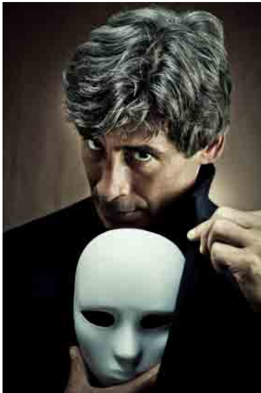
Eventually The Mask Comes Off – and Hopefully You Won't Have a Nightmare on Your Hands

People like Eddie Haskell, however, love to job hop –so they have highly developed their interviewing and resume-writing abilities. They know exactly how to make themselves look good, and they will gladly tell you what you want to hear. They also know the latest interview questions and just how to answer them – they are practiced and polished at it. Exactly what Eddie is – in terms of personality traits – will only come out sometime after they’ve been hired.