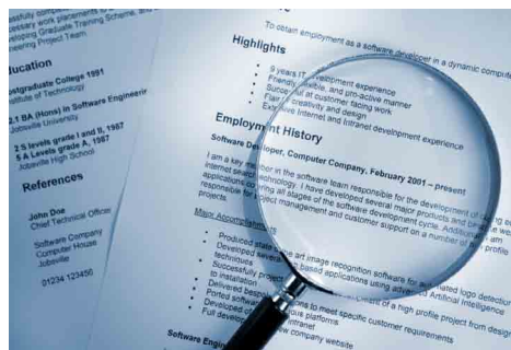
Evaluate and Categorize the Resumes to Discover the Best Talent

As you grade the resumes, be sure to take a quick look at their job history. If they have been at a company for a long time, note that it is quite possible that they are a high performer, but are just not used to writing resumes or ready to perform as well in the interview process. You certainly want to spend more time looking over their resumes in order to possibly identify A performers.