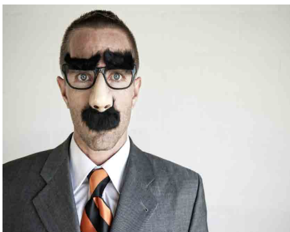
Masks Can Conceal a Lot of Undesirable Features

This same thing can happen when you take a new job, too. The people you were so impressed with during the interview process turned out to be totally different than you imagined. After working there about 90 days, you now see that working there is not as glamorous as you were first led to believe. On the other hand, it works the other way, too. You may have hired someone that seemed like the ideal candidate, and then after they start working there, it becomes obvious that they had deceived you.