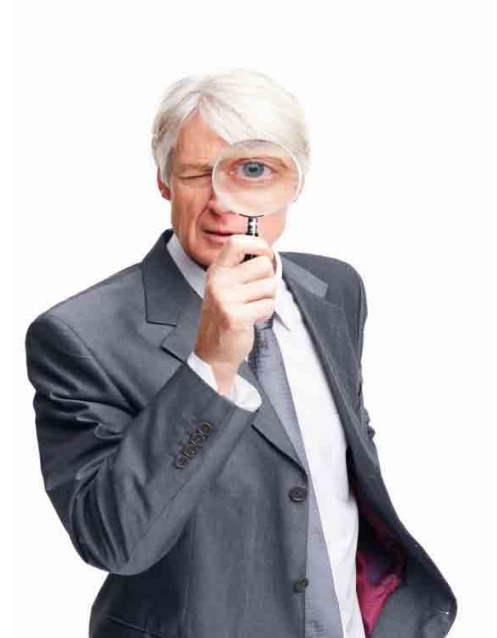
Get the Tools That Let You See Through the Masks

The goal here is to be able to identify the “Eddie’s” prior to hiring. You do this by spending enough time with them to get to know them well enough to let their true colors come out – before hiring them.