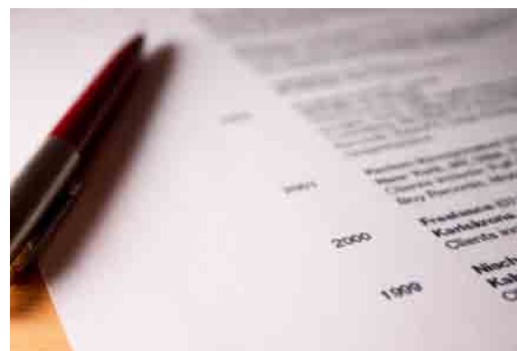
Evaluate and Categorize the Resumes to Discover the Best Talent

One thing that you want to watch out for is the fact that companies frequently become acquired by other companies. This will show on a resume as two different companies, but realize that the employee may actually still be working at the exact same job in the same place.