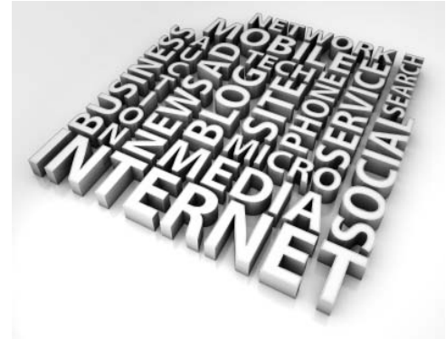
Use Many Forms of Advertising for Maximum Effect

In order to create the maximum effect you want, you need to use as many marketing tools and avenues as possible at the same time. This includes having a career website, blogging, social networking, face-to-face networking, and more. Removing just one member from the orchestra could produce a very noticeable difference in the results you achieve.