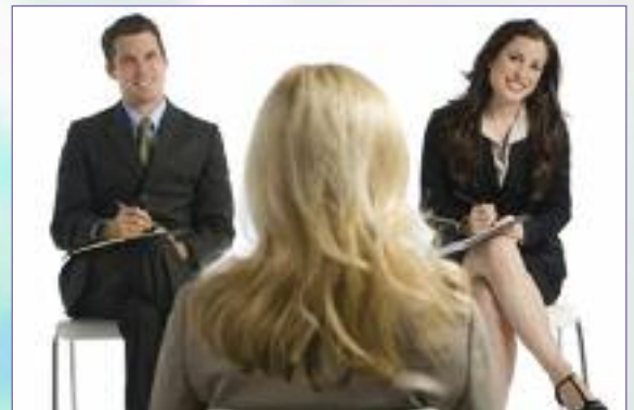
Unprepared interviewers are not able to select top talent.

Finding interviewers that are really prepared and qualified is not easy. Because of it, those who are not prepared bring little value to the interview process, and they stick out like a sore thumb. This can create many awkward moments and problems during the interviews, as well as giving bad impressions of your company, too.