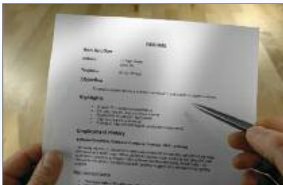
A resume may not provide you with the complete picture.

Typical resumes reveal the highlights of an individual’s career. They are also usually generalized in order to show the scope of capabilities and skills. In order to